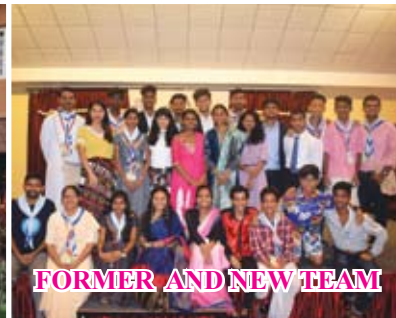
FORMER AND NEW TEAM