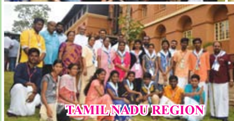
TAMIL NADU REGION