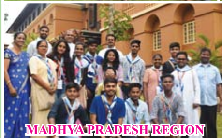
MADHYA PRADESH REGION