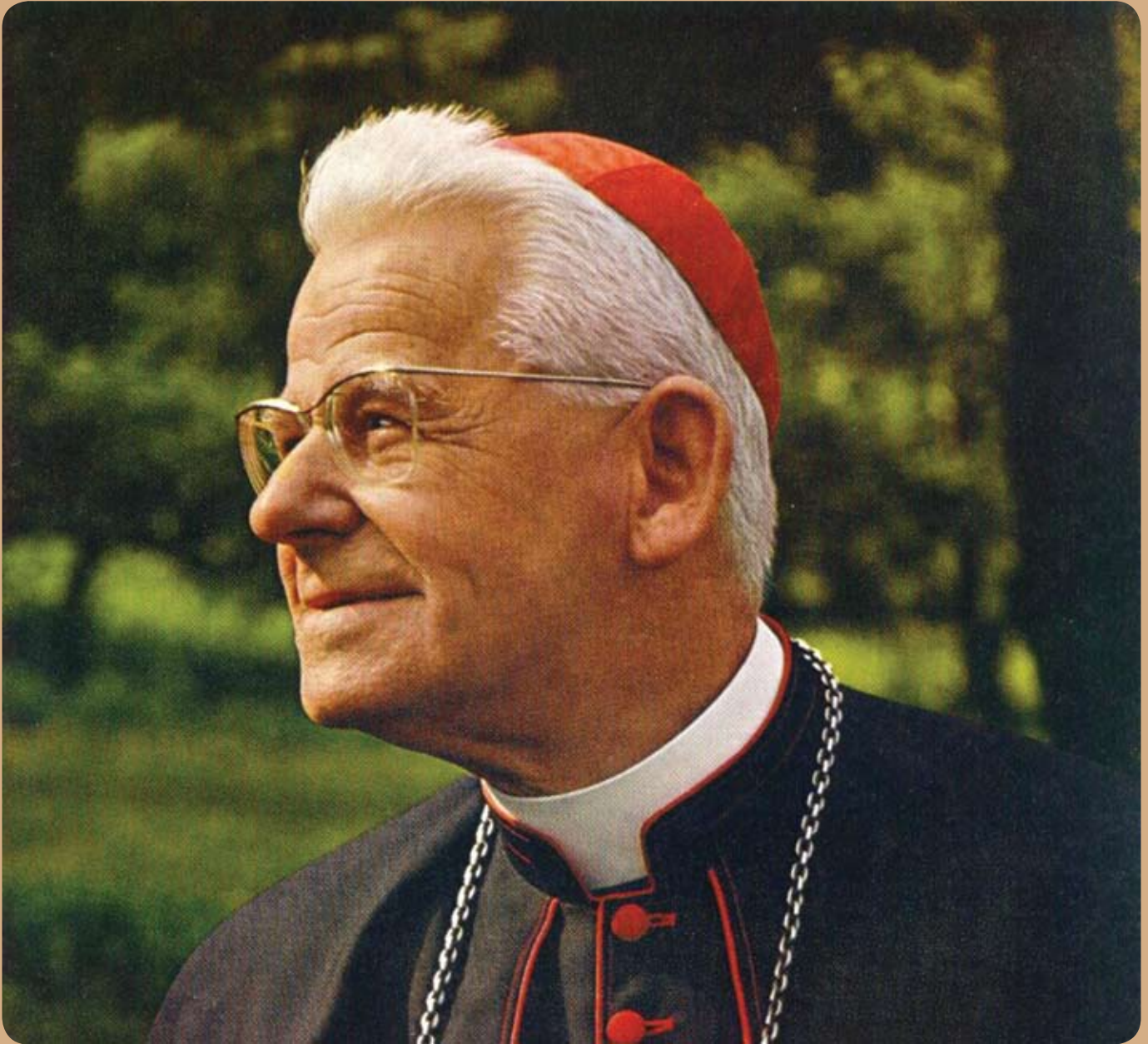
Joseph Cardinal Cardijn

“We are still at the beginning, we are always at the beginning, we are just beginning.”