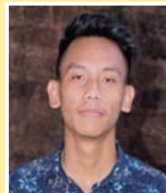
Abolon Taro NEXCO (North East)

Y outh is the time of life when one is young and it often means the time between childhood and adulthood. Young people spend much of their lives in educational settings, and their experiences in schools, colleges and universities shape much of their subsequent lives. The young generation is full of life. They are curious to learn new things and are ready to explore the world. They are high on energy and do not want to conform to the customs and traditions set by the earlier generations. They try to apply logic to everything and question the radical thinking of the elders. Although, they usually end up annoying them later. There are several factors that push the younger generation to sway away.