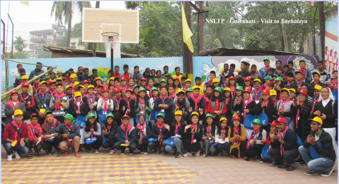
NSLTP - Guwahati - Visit to Snehalaya

Young Christian Students/Young Students Movement, (An Unit of CCBI Youth Commission) YCS/YSM National Office, Archdiocesan Pastoral Centre, 25 Rosary Church Road, Santhome, Chennai - 600 004 Ph : 044 - 24641737, e-mail : ycesysmindia@gmail.com ; website : www.ycesysmindia.com