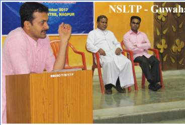
NSLTP - Guwahati & Nagpur