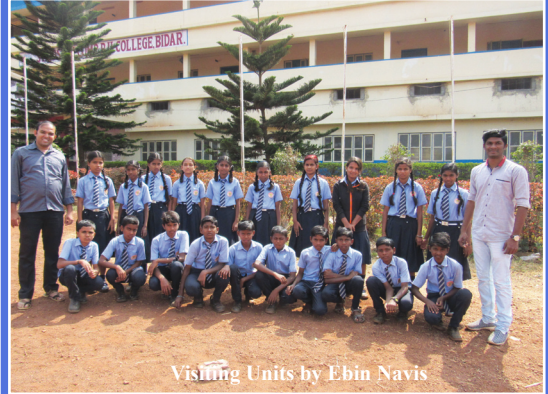
Visiting Units by Ebin Navis