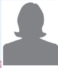
Sr. Bernadette RYD, North East