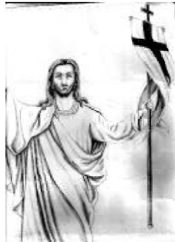
- Veronica Gomes, Kolkatta

Do you have a story to share...? Can you make a difference...???