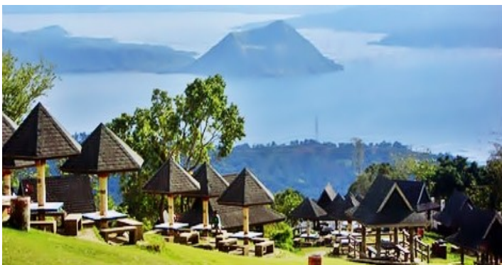
Picnic Grove Park in Tagaytay City overlooking Taal Volcano and Lake

Tagaytay City is considered as the country's second summer capital (next to Baguio City) because of its cool climate and elevated location. It is a treasure box of pleasure points in by itself. At nightfall, one sees the lake sparkle with the pinpoint lights of fishing boats. The most iconic tourist site is the View of Taal Lake and Volcano which spread throughout the city. The city has a number of café's, malls, parks and supermarkets .